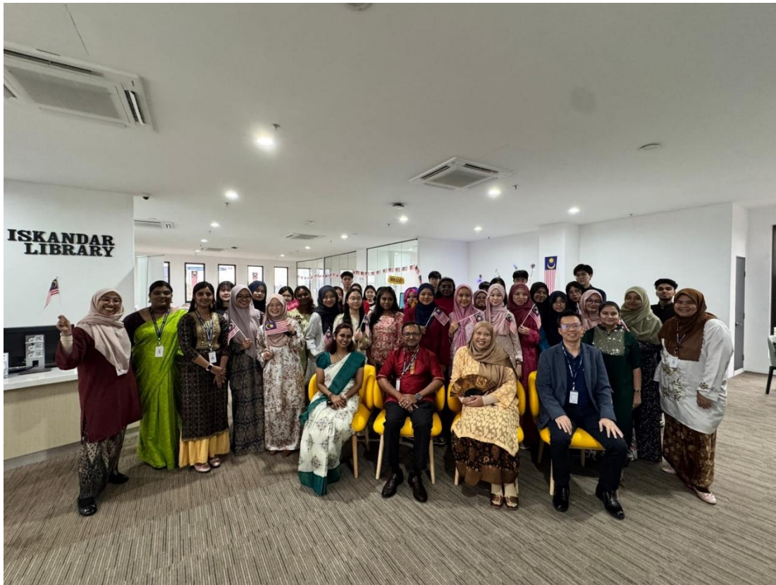
Merdeka Celebration 2025

In the spirit of Merdeka Month, Student Life and the TES Iskandar Library collaborated to organise a series of patriotic and creative activities. Students proudly expressed their creativity in the Jalur Gemilang Art Challenge by designing Malaysian flags using recycled materials, while the 'Trivia Merdeka Challenge: Know Your Malaysia' tested their knowledge of the nation's history and heritage.