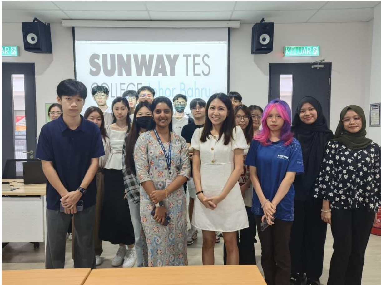
'Smart Eating for a Healthier Life' Health Talk

Sunway TES College Johor Bahru (STESJB) continues to provide students with enriching experiences that go beyond the classroom. From health awareness and sustainability projects to patriotic celebrations and career readiness initiatives, the past months have been filled with impactful activities for both students and staff.