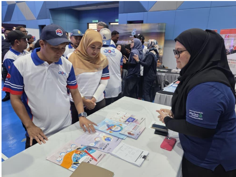
Roadshow @ Tanjung Surat, Kota Tinggi, Johor

A dedicated briefing was conducted on the ACCA and ICAEW programmes, showcasing professional pathways in accounting, global recognition, and promising career prospects for students. This initiative reflects STESJB's commitment to nurturing young talent in Johor and guiding them towards internationally recognized qualifications in the accounting field.