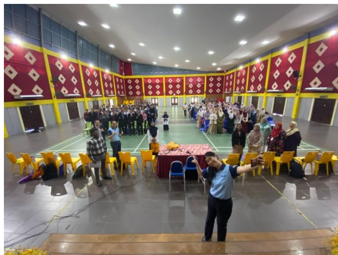
Mock Interview Sessions @ SM Sains Batu Pahat, Johor

On 23 August 2025, the campus came alive during the Campus Open Day. Students and parents explored the vibrant learning environment, with a strong focus on programmes such as ACCA, Diploma, and ICAEW. The event was a valuable opportunity for prospective students to discover the exciting academic and career pathways available at STESJB.