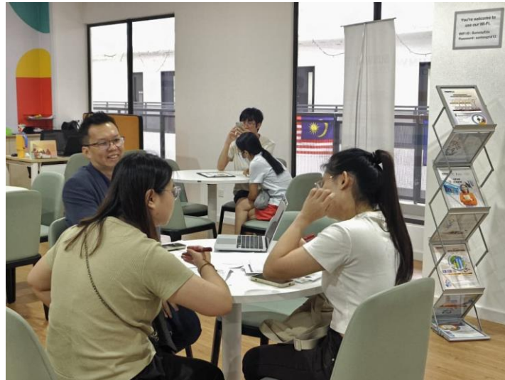
Campus Open Day

As part of the MPU2332 initiative, students conducted a Soap Berry Making Workshop, where participants learned to create eco-friendly soap that is both gentle on the skin and safe for the environment. This activity supports SDG Goal 6: Clean Water and Sanitation, reflecting students' commitment to promoting sustainability and healthier communities.