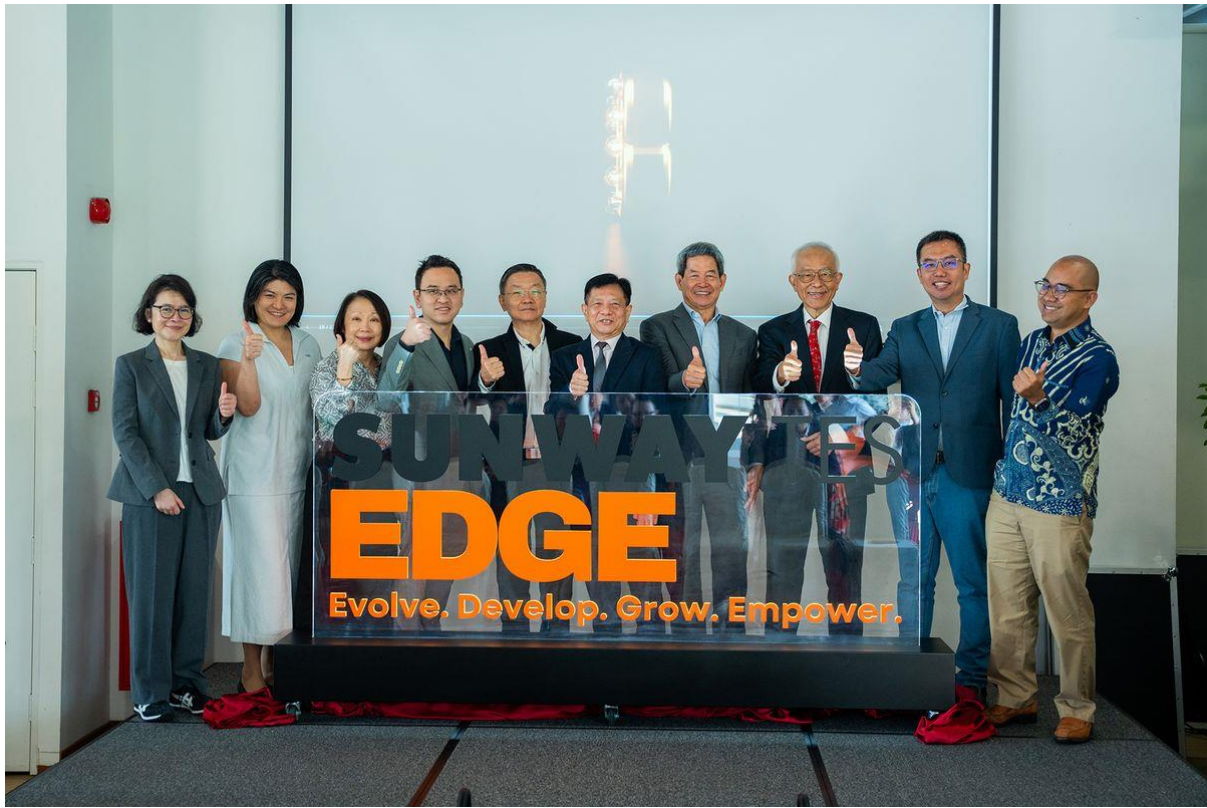
Launch of Sunway TES EDGE, officiated by Professor Teo Ee Sing, together with representatives from various accounting firms.

Malaysia's initial target of producing 60,000 accounting professionals by 2020 was not achieved, and the nation now projects the need to reach this figure by 2030 to meet industry demand.