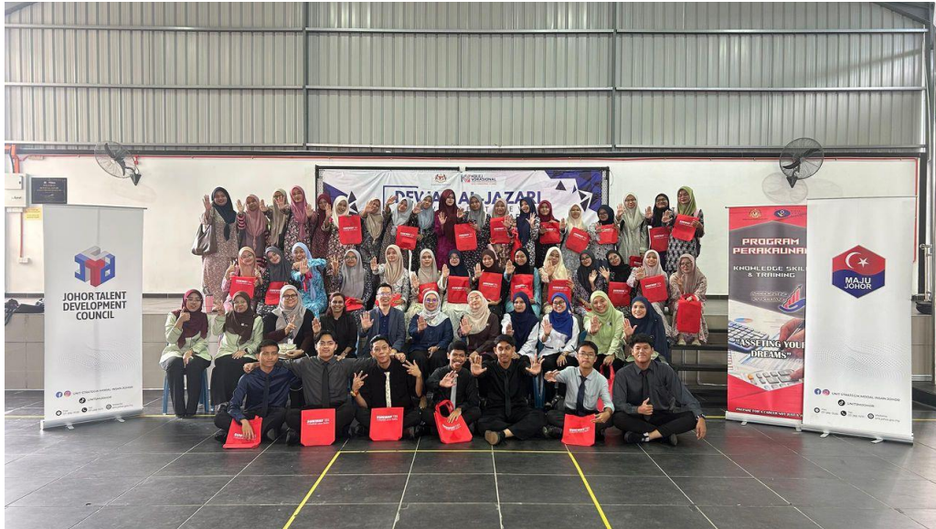
Programme Briefing @ Kolej Vokasional Kluang, Johor

A dedicated briefing was conducted on the ACCA and ICAEW programmes, showcasing professional pathways in accounting, global recognition, and promising career prospects for students. This initiative reflects STESJB's commitment to nurturing young talent in Johor and guiding them towards internationally recognized qualifications in the accounting field.