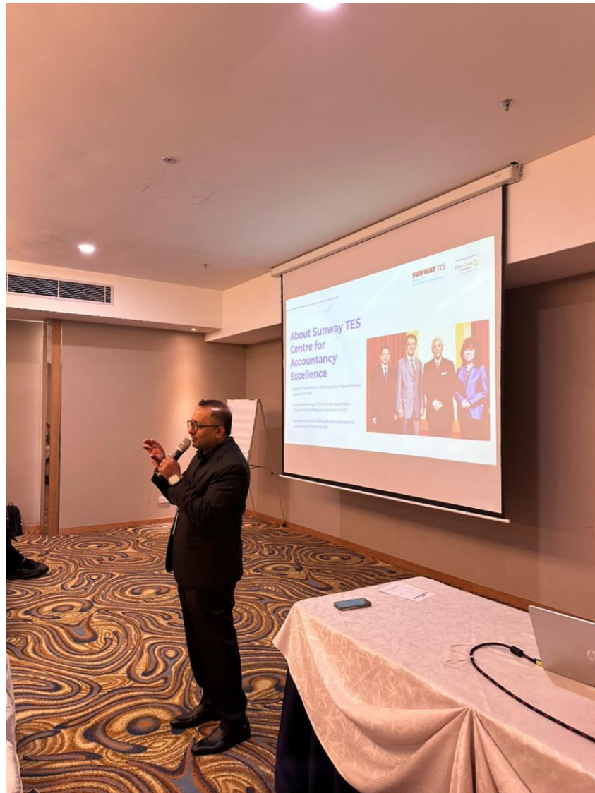
Programme Briefing @ Holiday Villa Hotel, Johor Bahru

Sunway TES College Johor Bahru (STESJB), in collaboration with the Johor Talent Development Council (JTDC), recently participated in a series of engagement sessions and roadshows across Johor. The initiatives aimed to raise awareness of professional education pathways, career opportunities, and international qualifications available to students in the state.