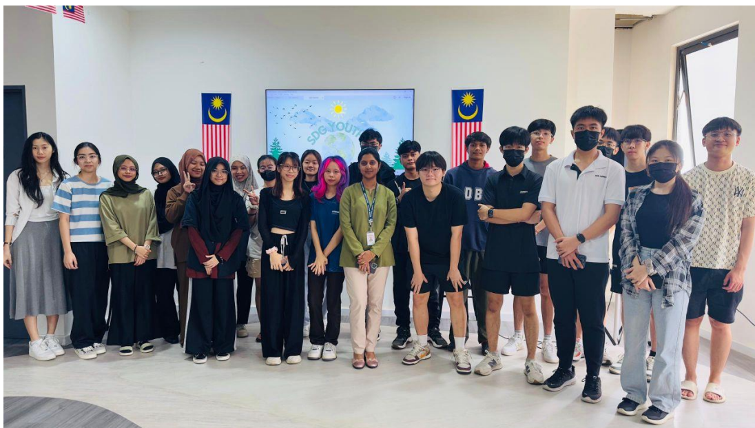
Soap Berry Making Workshop

In the spirit of Merdeka Month, Student Life and the TES Iskandar Library collaborated to organise a series of patriotic and creative activities. Students proudly expressed their creativity in the Jalur Gemilang Art Challenge by designing Malaysian flags using recycled materials, while the 'Trivia Merdeka Challenge: Know Your Malaysia' tested their knowledge of the nation's history and heritage.