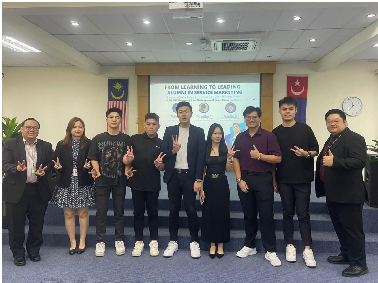
Our alumni in attendance during the sharing session

This session not only deepened students’ understanding of service marketing but also strengthened the bond between current students and alumni. Sunway College Johor Bahru extends its heartfelt appreciation to the alumni for taking the time to give back, and we wish them continued success in their careers!