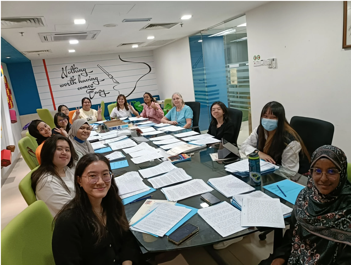
Group photo of the judging panel.