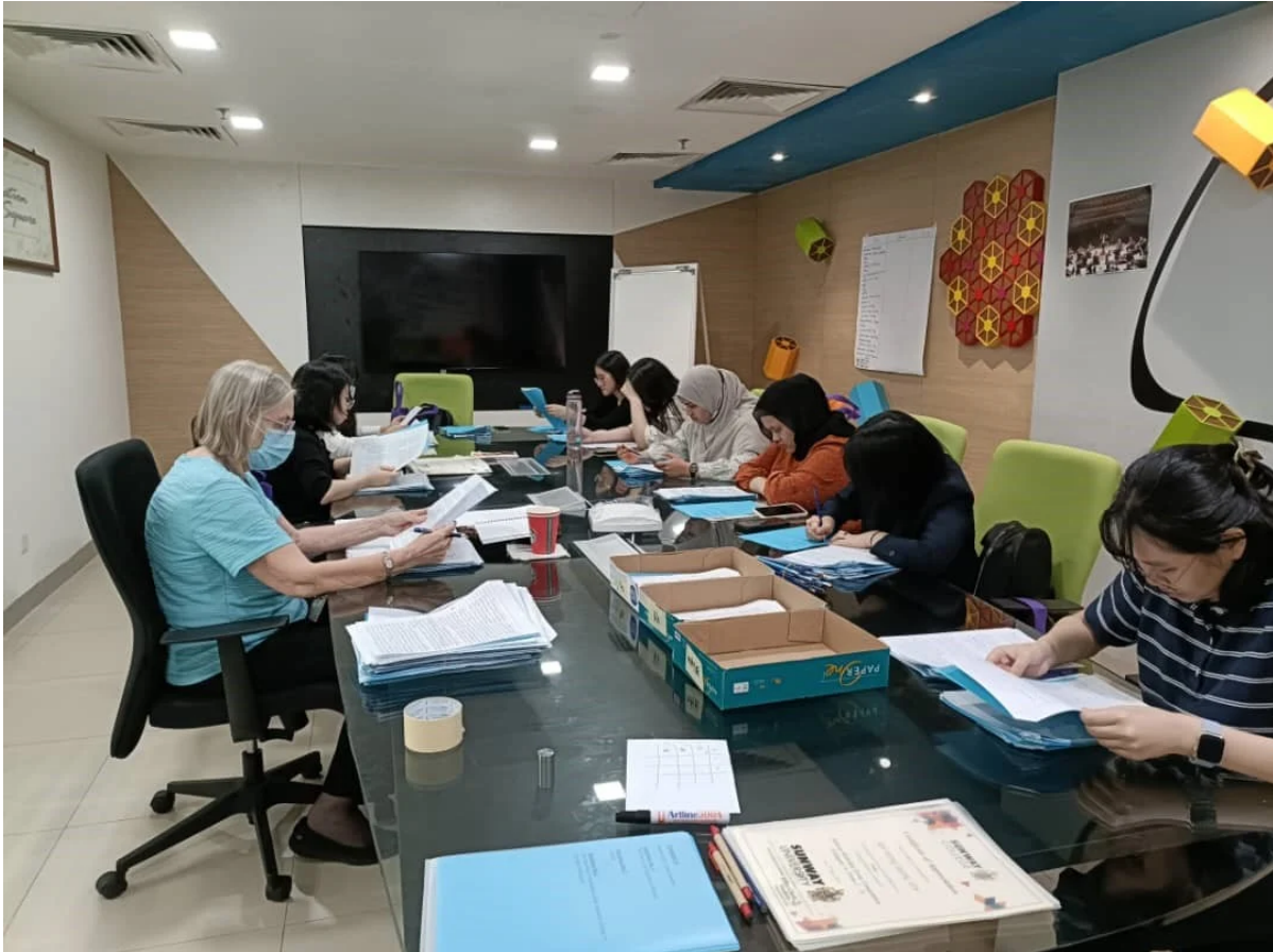
Students marking the essays.