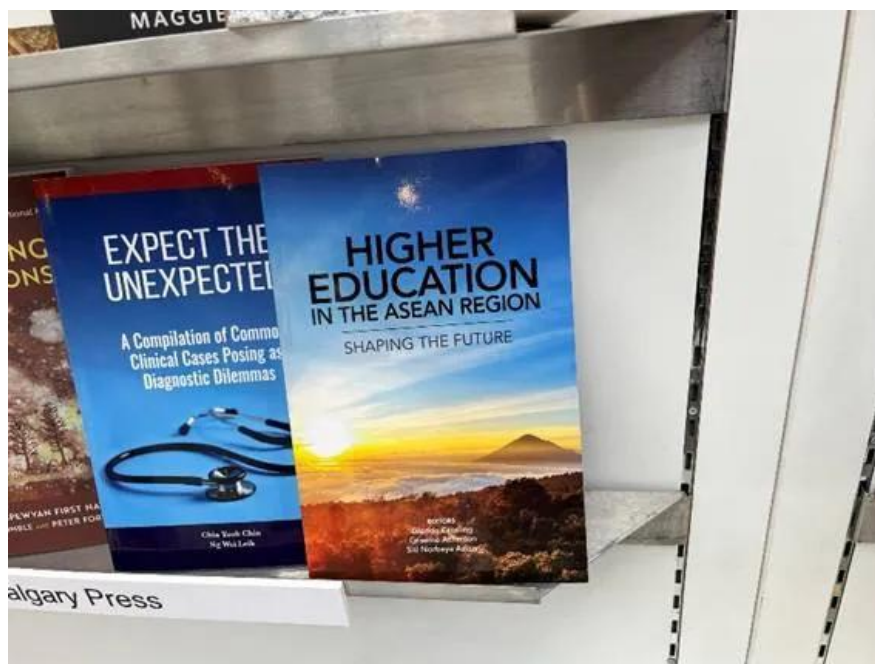
Sunway University Press' Expect the Unexpected and Higher Education in the ASEAN Region at the London Book Fair 2024

Exhibiting under the umbrella of Eurospan, IPG Publishers Group & Marston Book Services, Sunway University Press highlighted its two hot-off-the-press titles: Expect the Unexpected: A Compilation of Common Clinical Cases Posing as Diagnostic Dilemmas and Higher Education in the ASEAN Region: Shaping the Future . These publications delve into the opportunities and challenges of healthcare and higher education in Malaysia and the ASEAN region respectively, reflecting Sunway University Press's continual commitment to addressing practical contemporary issues through scholarly discourse.