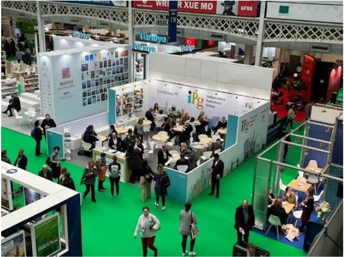
A steady stream of visitors at the stand where Sunway University Press titles are exhibited

The successful participation of Sunway University Press in the London Book Fair underscores its dedication to promoting scholarly exchange and knowledge dissemination and advancing impactful content that contributes to intellectual discourse on a global scale.