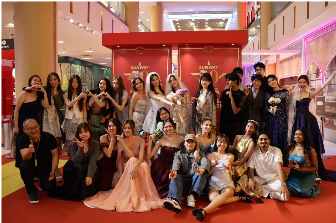
Fashion students and models of Sunway College and Sunway University.

Upon closing the show for the very last time on their last show slot, almost a year of hard work had come to an end with the students and models cheering in celebration of successfully completing their very first fashion show. This accomplishment gave the young designer students the confidence they needed to host their next fashion show, coming in May 2024.