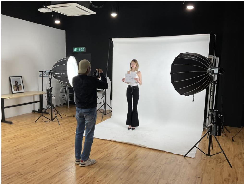
Model casting organized by FDTS students

The project was launched in 2023 where the Sunway Theme Parks team had come over to the Fashion Hub to brief our students on the collaboration project, which involved designing Wedding Costumes for Captain Quack and Lady Quack's upcoming wedding ceremony. This would mark our students' very first experience in costume-making, which conveniently aligned with FDTS' holistic approach of training students to have an expansive range of skills. The students even got to dip their toes in the world of backstage management by hosting model casting calls, arranging model look cards, runway routes and all things needed to run a fashion show smoothly.