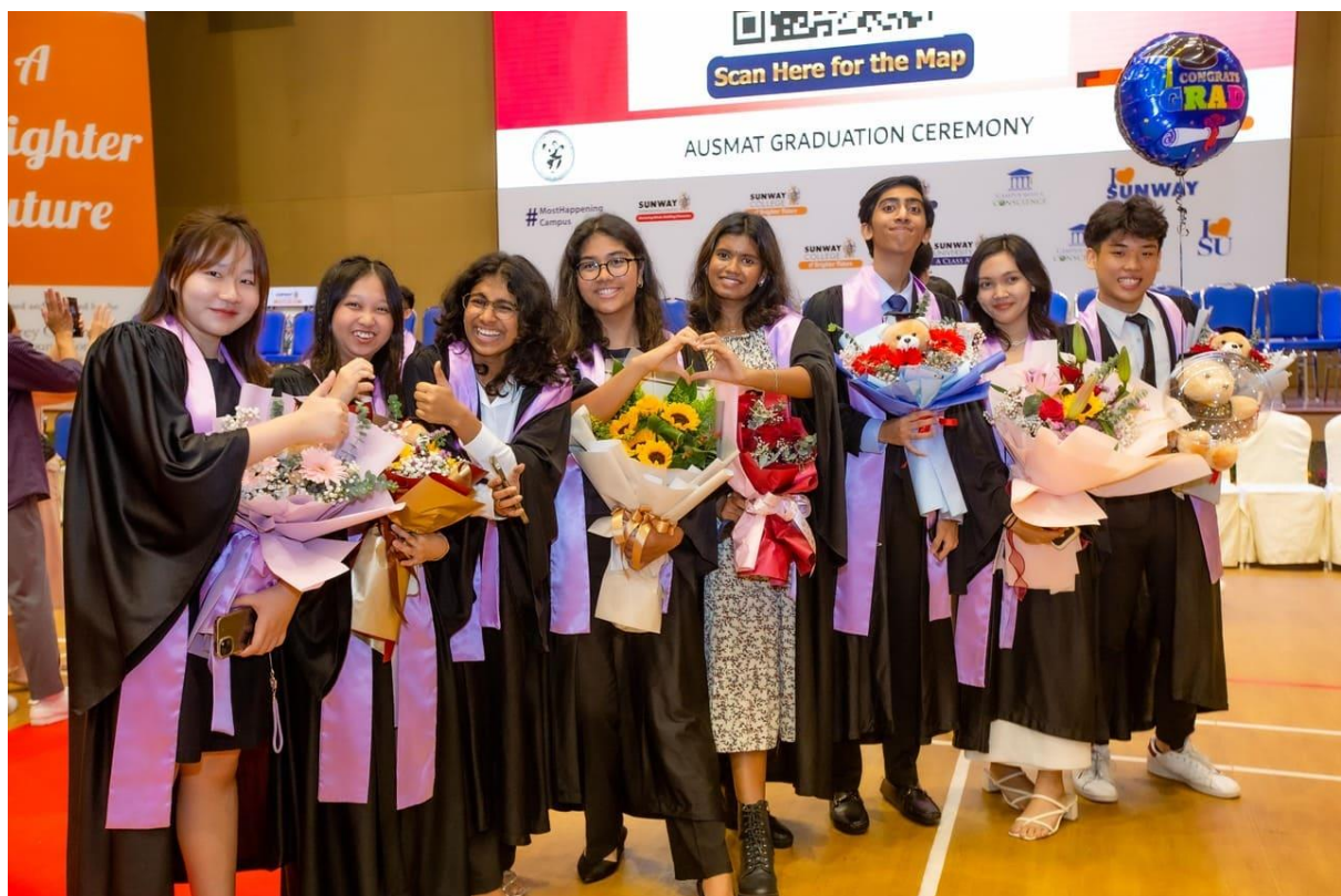
A communal celebration of success to embrace achievement.