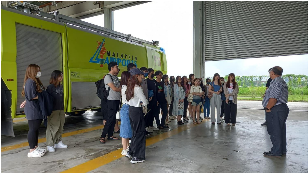
Top and bottom photos: Briefing on the safety protocols in KIA