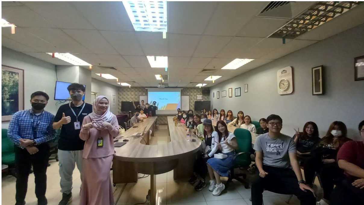
Group Photo with the KIA Personnel after the briefing