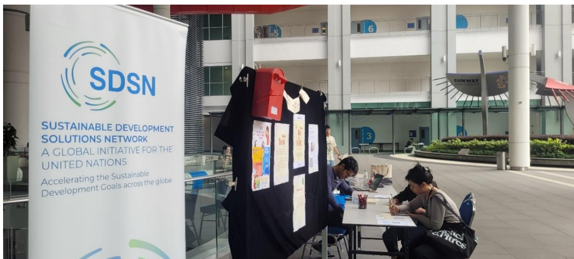
A quiet moment for contemplation of people in our lives.