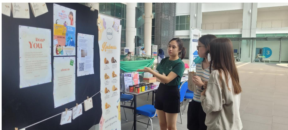
Participants were given the opportunity to pass on kindness to an organisation in support of persons with disabilities as well.

Internally, kindness was in abundance as well! SDSN Sunway was more than willing to provide the seed-funding to help kick off this project by covering the postcard material and printing cost. It was a huge aid in enabling this project to take off the ground. The kindness did not end there, the minds behind FM2U pooled their resources together and was able to form a contract with Giving Opportunities For Learning Disabled (GOLD). Utilizing the booth they had booked to also sell the products manufactured by GOLD staff while also promoting their cause to the masses at Sunway. Donations towards 58 jars of homemade cookies and 5 handmade notebooks amounted to RM1,094.