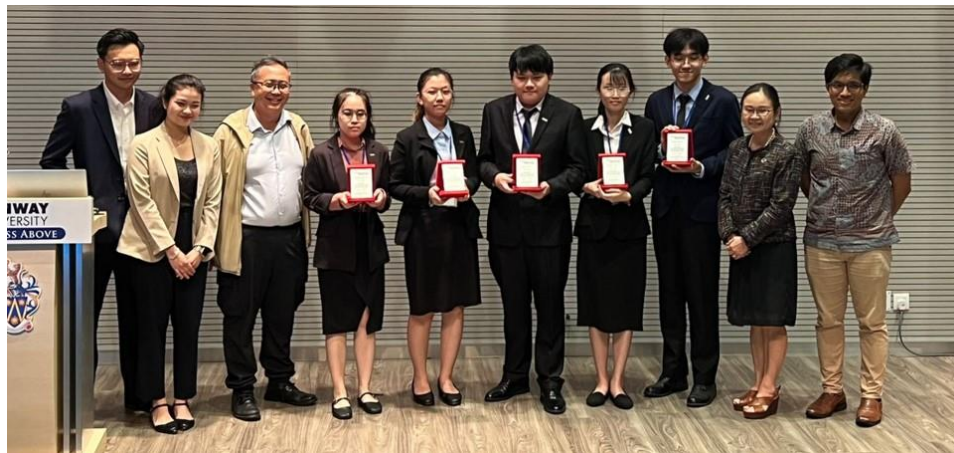
'Team Supernova' is awarded Top 3 finalists for the Malaysia round