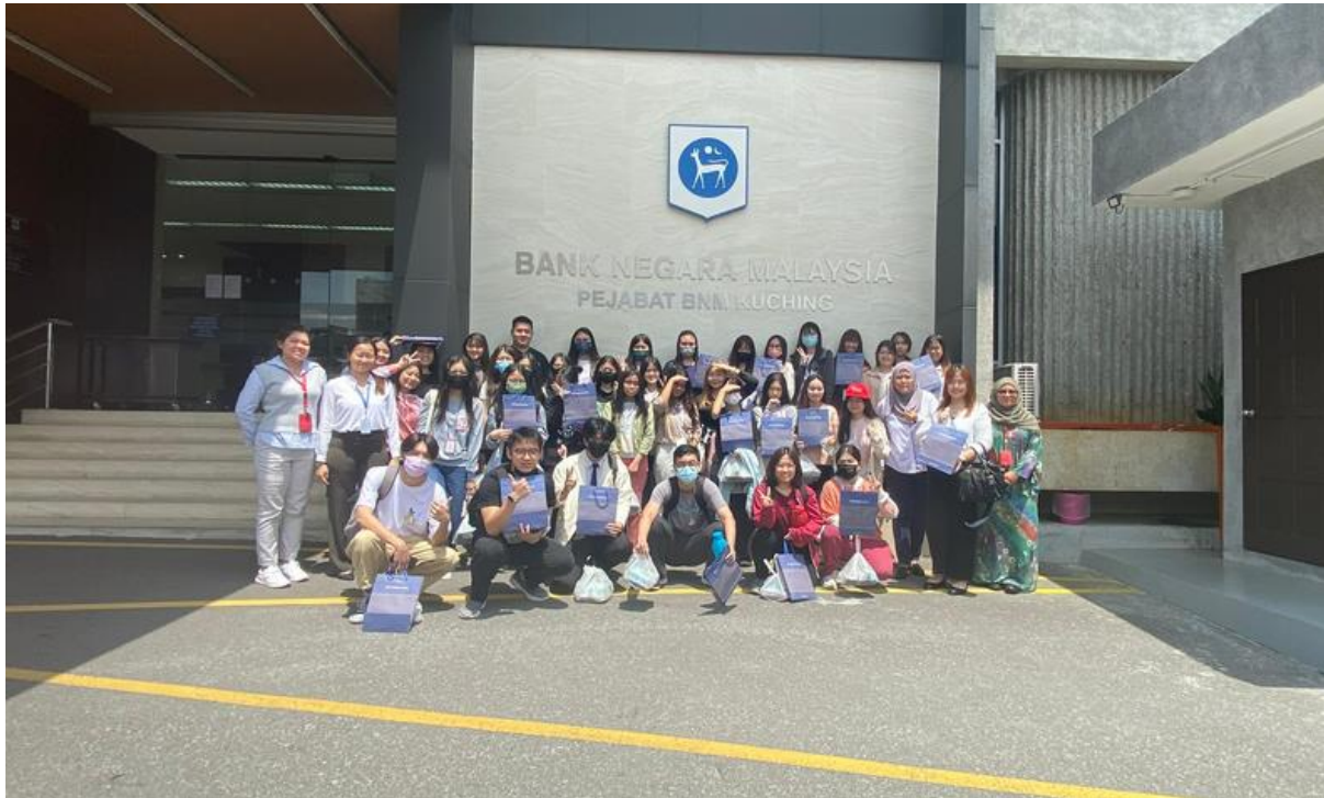
Sunway College Kuching's students taking group photo with BNM's representatives after the visit.

A group of students from Sunway College Kuching had recently attended a field trip to the Bank Negara Malaysia (BNM) branch in Kuching. The visit aimed to give the students insights into the latest developments and trends in the Malaysian economy, exposure to how economy stabilization works in the real world, and to enhance their understanding of economics theories and regulations.