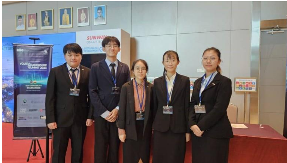
Sunway College JB participants from Diploma in Information Technology, collectively known as 'Team Supernova'