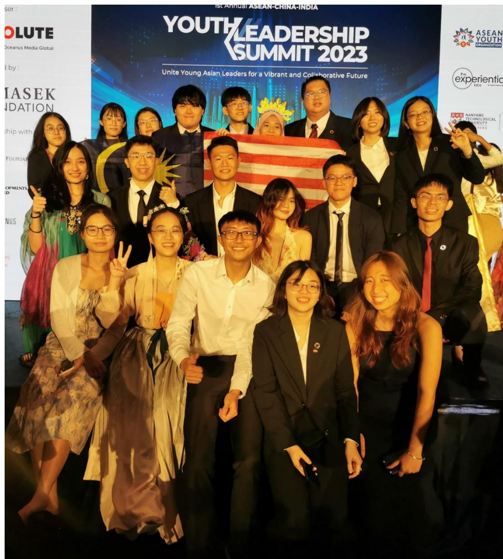
Team Supernova with the rest of the Malaysia delegation in Singapore for the ACI YLS 2023

The rising challenge in Malaysia which prompted the solution by 'Team Supernova'