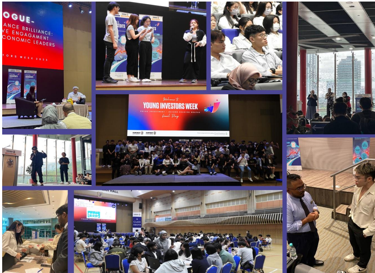
Young Investors Week 2023 organised by Diploma in Business Administration program, Sunway Diploma Studies