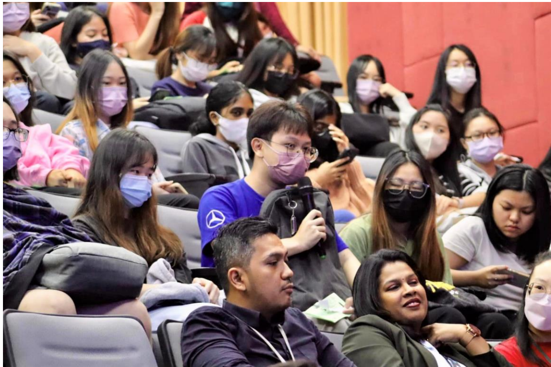
Students raising a question during the forum session