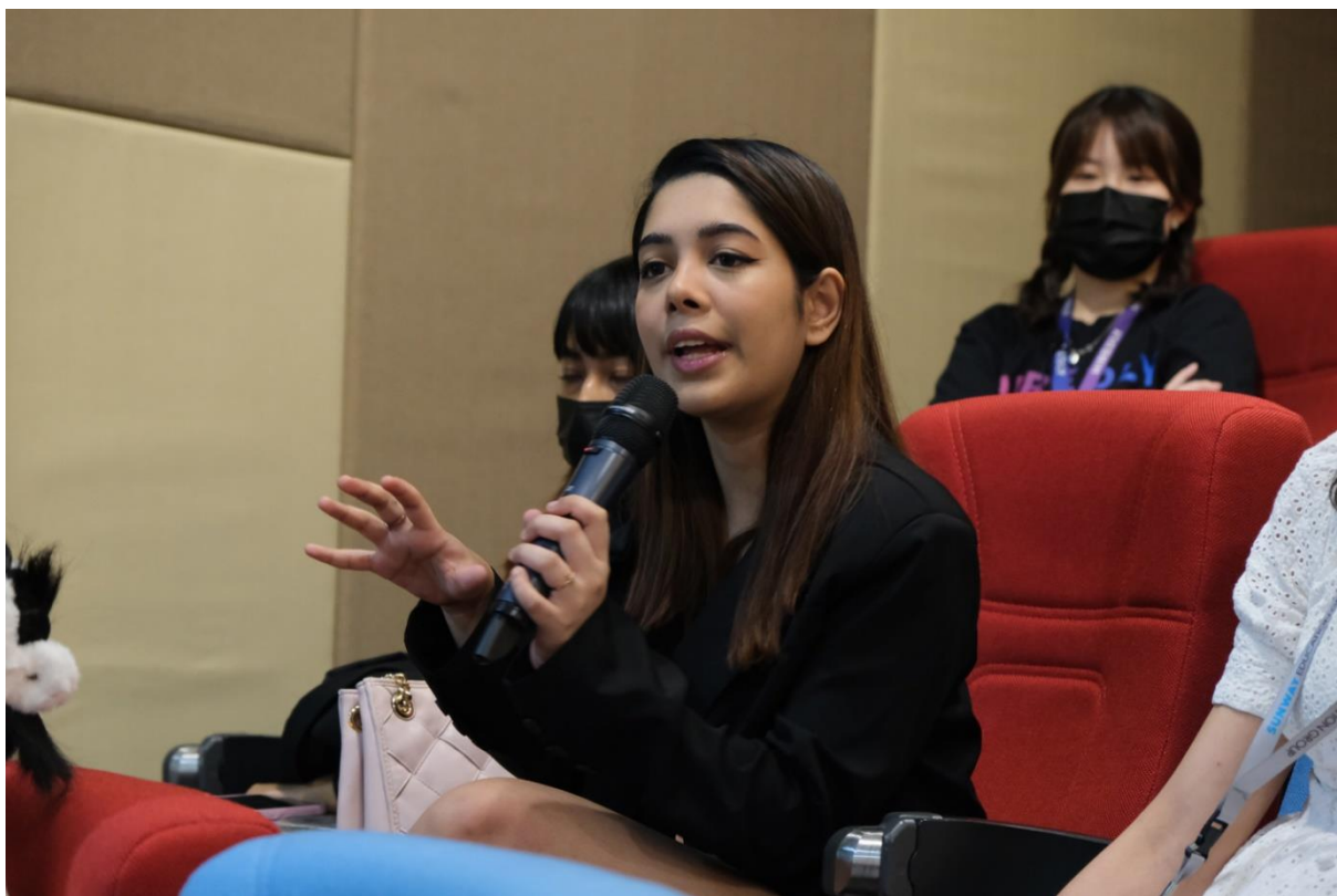
Audience members during the talk