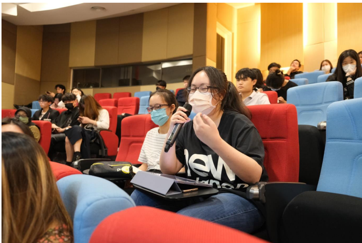
Students engaged in the Q&A session