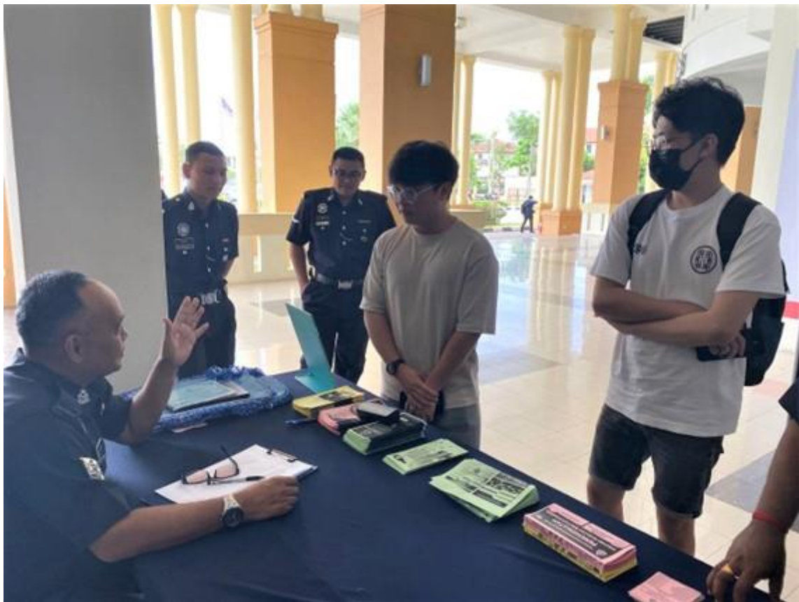
Volunteer Smartphone Patrol (VSP) promotion counter