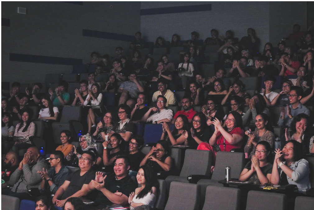
Crowd enjoying themselves during the Punchlain Comedy Night.