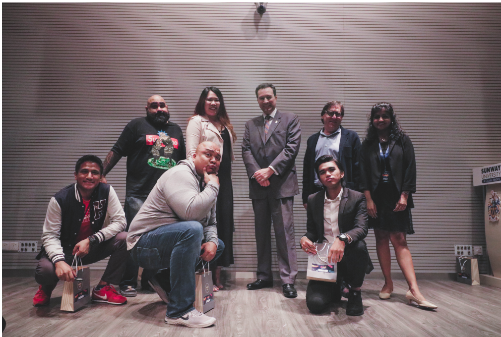
Malaysian stand up comedians in action!