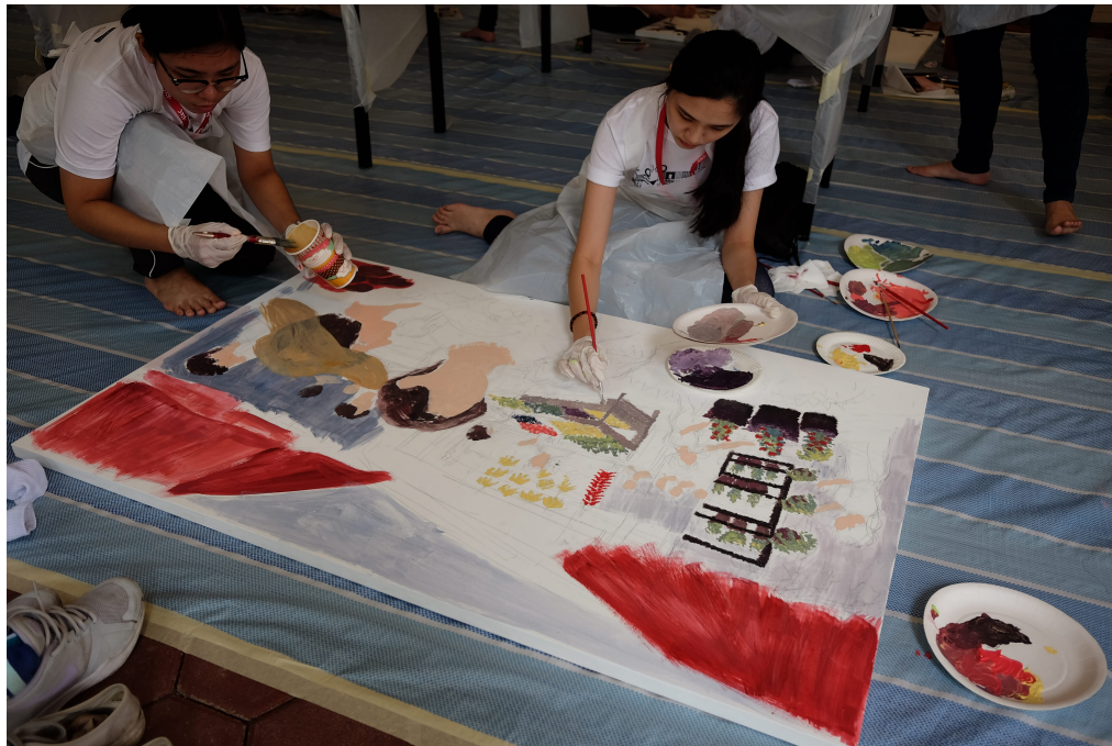
Students preparing their artwork for the MIID competition.