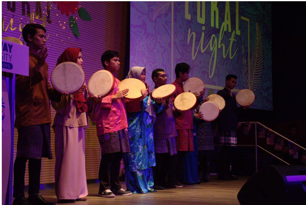
Sunway University's Kompong Team escorting VIPs on the night.