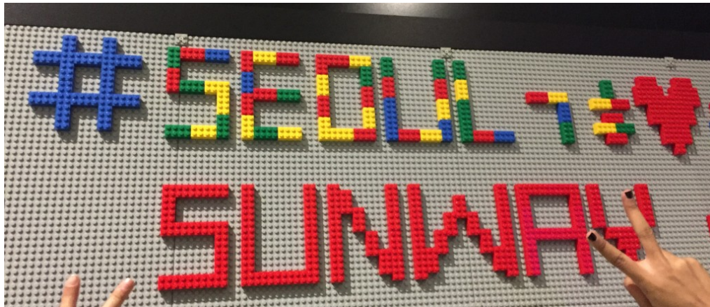
One of the projects that the students worked on in Daelim University College.

inspection. Besides visiting educational institutions, the students could not miss out on visiting tourist attractions in Seoul! The students were able to make trips to Gyeongbokgong Palace, Myeongdong, Seoul Tower and many more.