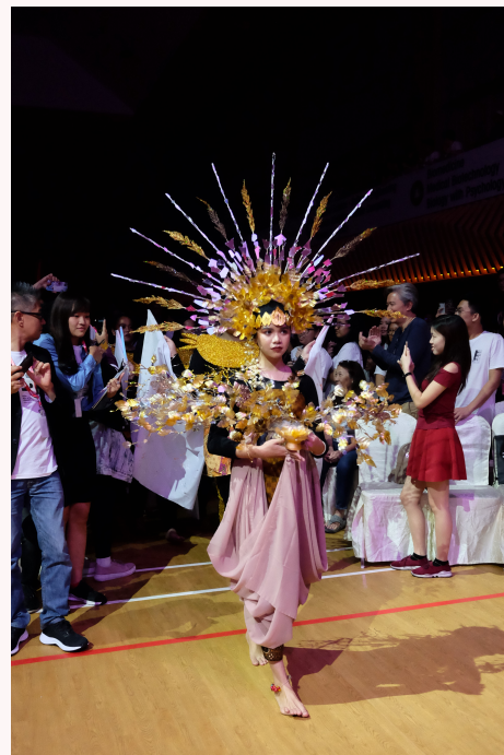
Deria Fashion Show showcasing students' creativity during the MIID event.