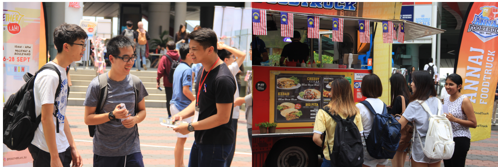
Students queuing for food trucks that highlight Malaysian flavours!

After the soft launch was the 'Lokal Bazaar' whereby different food trucks and vendors were called in to sell local Malaysian food, demonstrating the diversity of Malaysia's cultural cuisine.