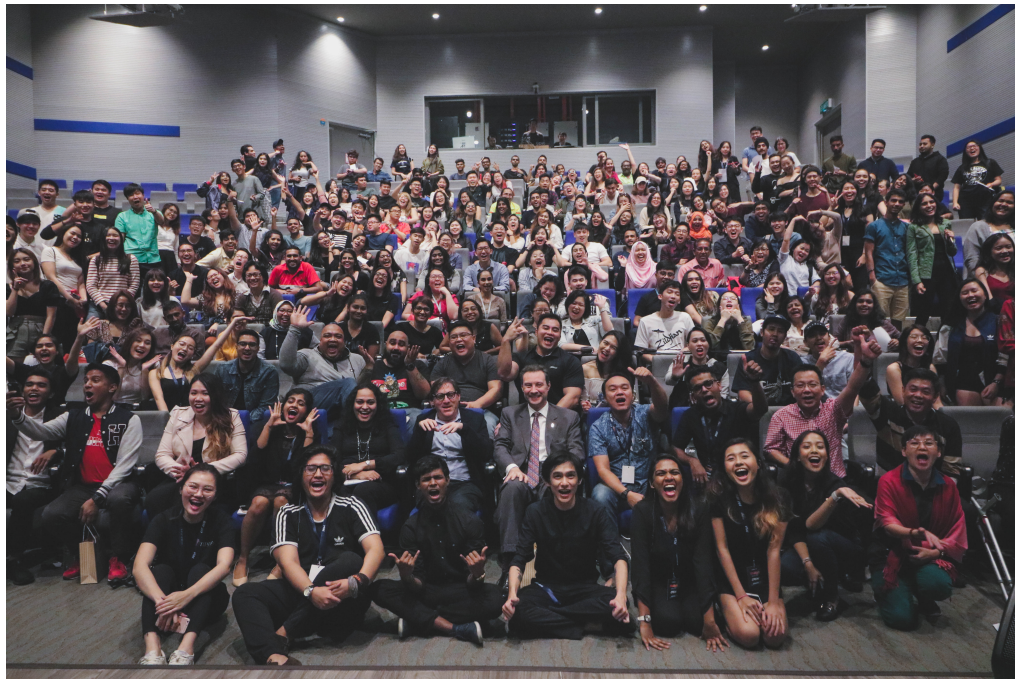
Group photo with the VIPs and audience.