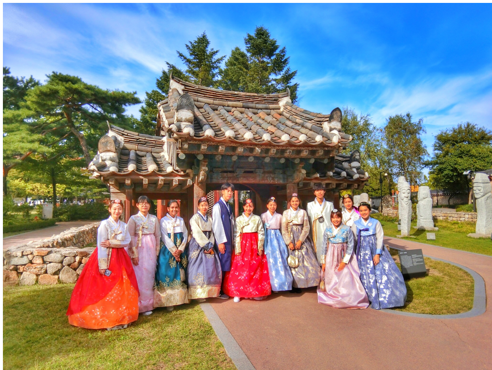
Students dressed up in Korean traditional wear - Hanbok and posing for a group photo.