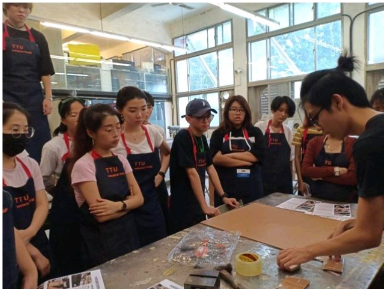
Students listening to explanation by instructor.