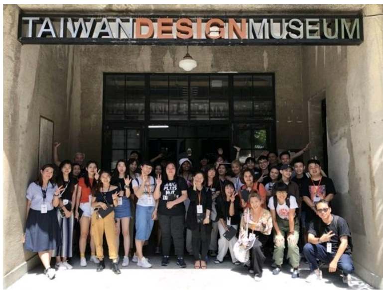
Students posing in front of the Taiwan Design Museum.