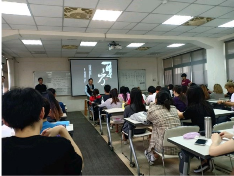
Students attending the cultural design workshop.

The 10-day trip to Taiwan was a fruitful one as students were able to learn from one another, especially with people around the world -- China, Taiwan, Thailand. Students were also able to produce amazing products though given a tight timeframe to complete.