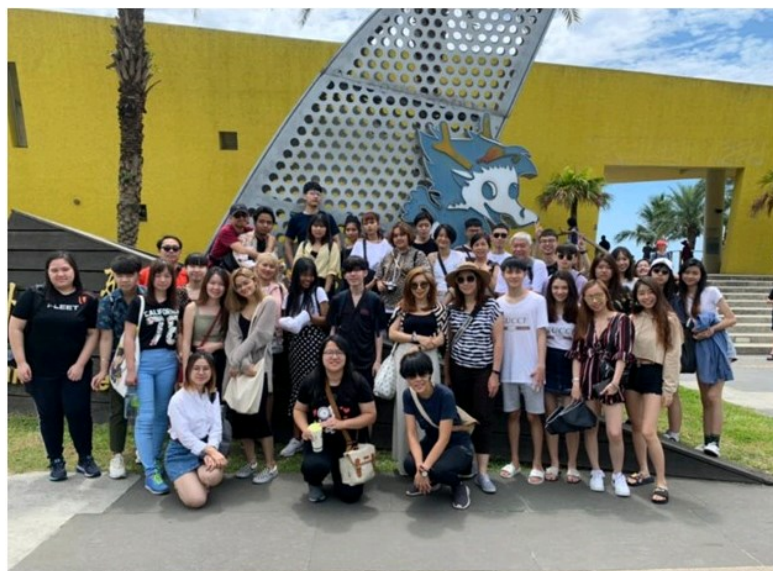
Students and lecturers pose together for a group photo.