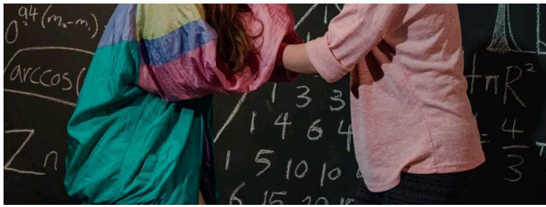
Scenes from the play.