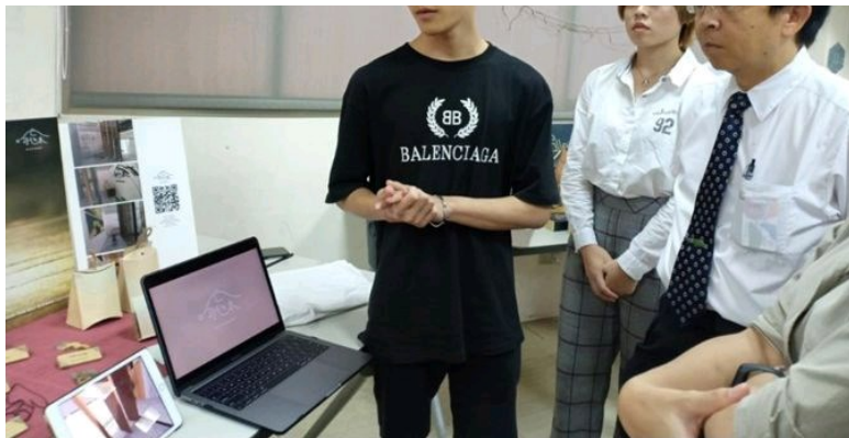
Student explaining his end product to his fellow coursemates and lecturers.