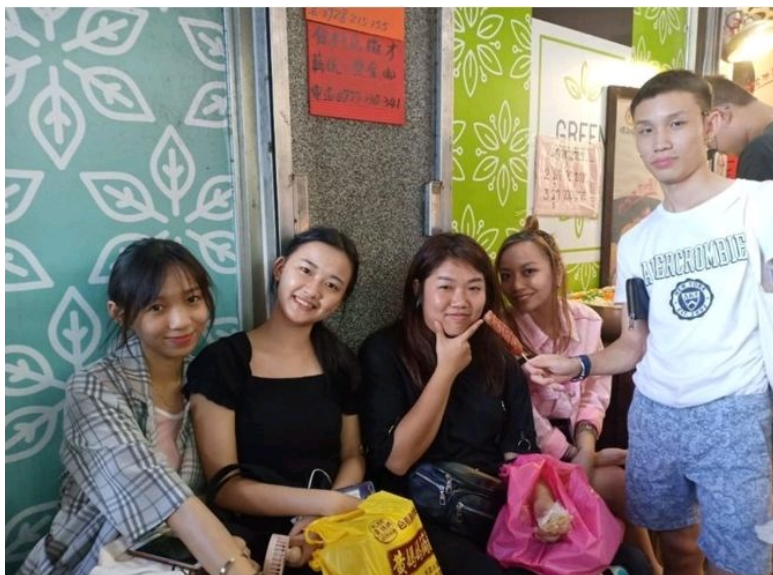
Students enjoying their time at one of the famous markets in Taiwan.

During the weekend, students were given free time to chill out at beaches and famous markets in Taiwan.