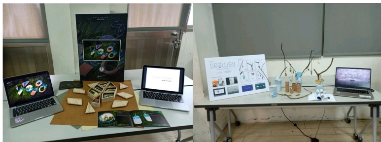
Examples of students' final jewellery products.

During the weekend, students were given free time to chill out at beaches and famous markets in Taiwan.