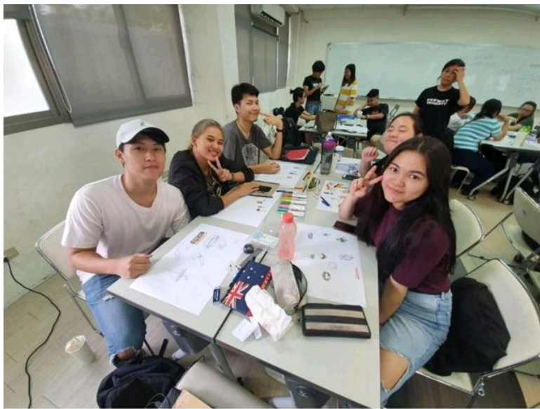
Students attending jewellery making and branding workshop in Tatung University.