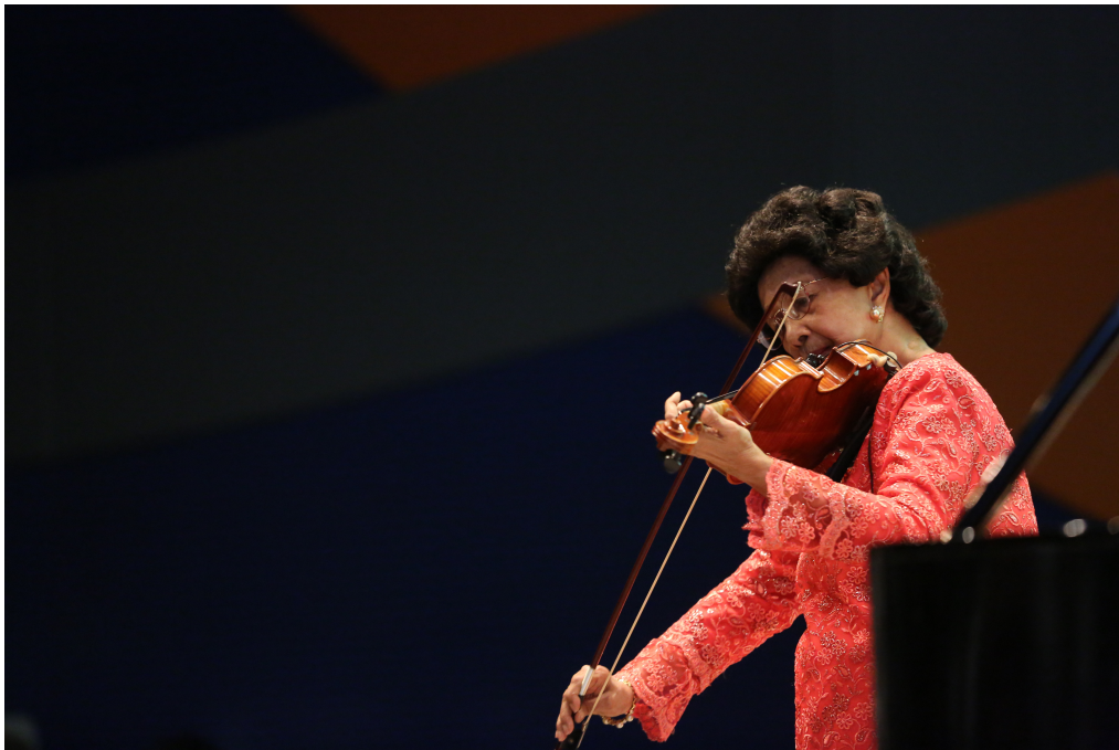
Tun Dr Siti Hasmah playing the violin on stage.