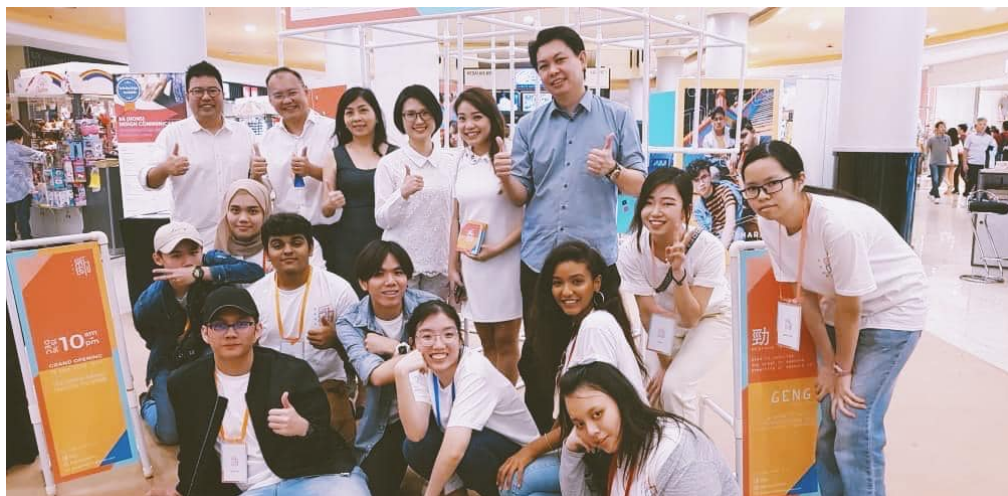
Final year students from DGM pose for a photo with lecturers.