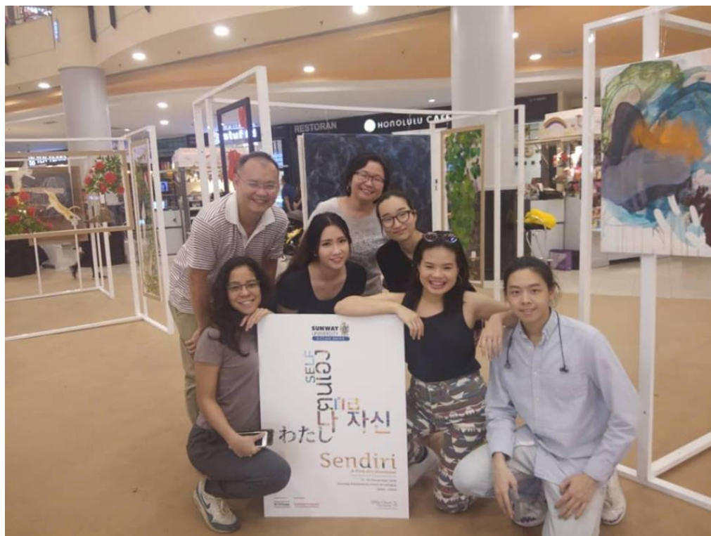
Graduating students pose for a photo with their lecturers.