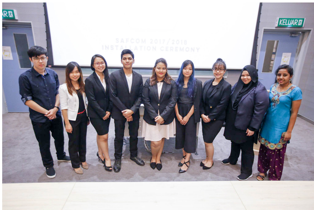
Outgoing team of SAFCOM 2017-2018