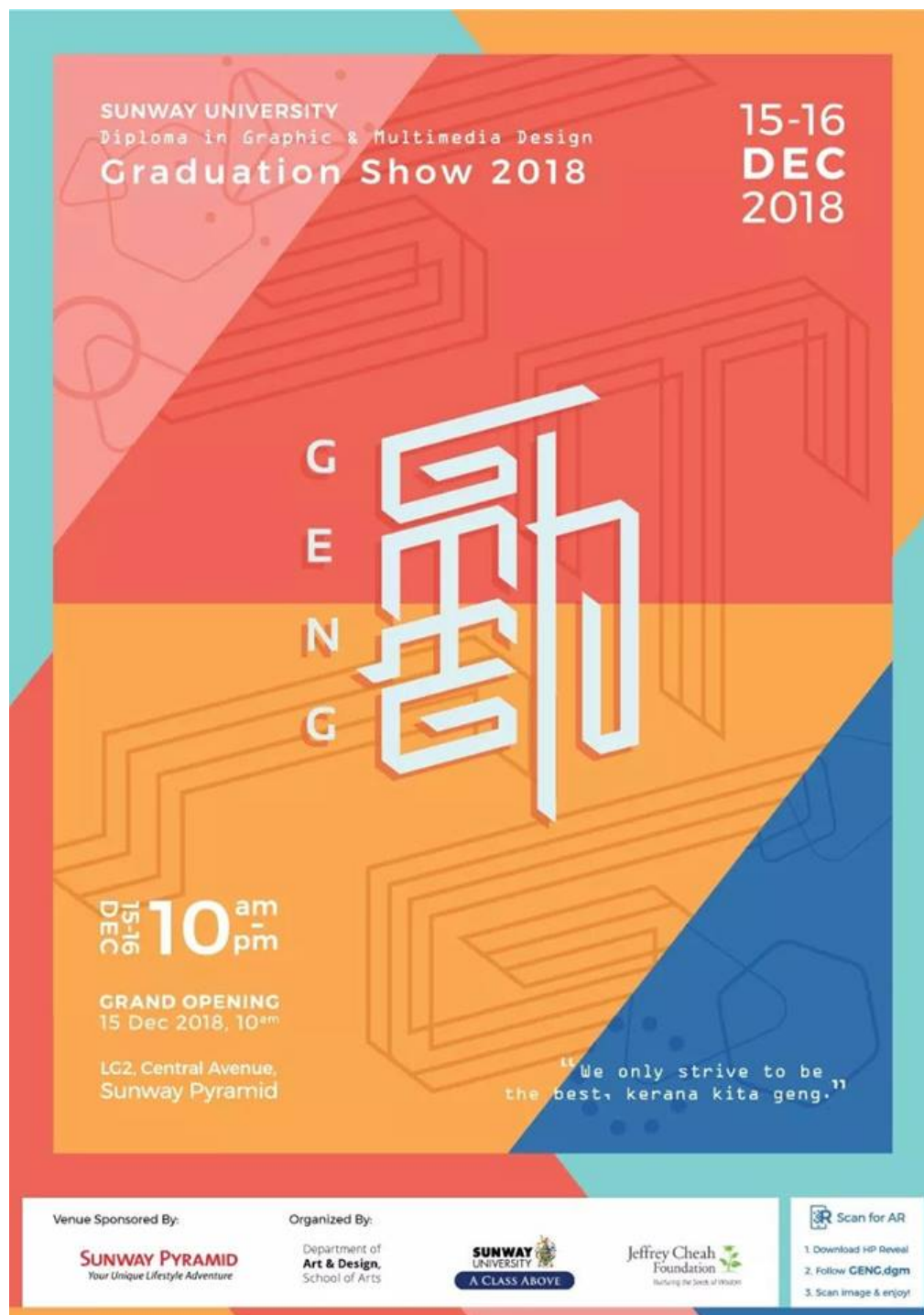
Official poster for GENG Graduation Showcase by DGM students.

Lastly, we have the final year students from DGM who introduced their exhibition titled "Geng". Refer to the photos below to see what they have presented!