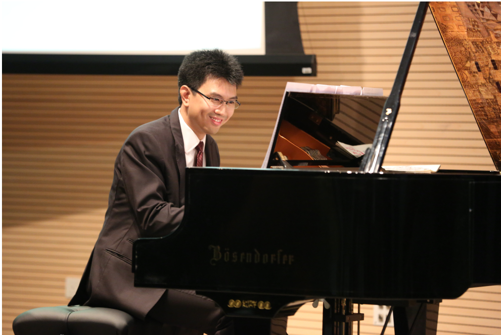
Tunku Zain Al-'Abidin Tuanku Muhriz performing on stage together with Tun Dr Siti Hasmah.