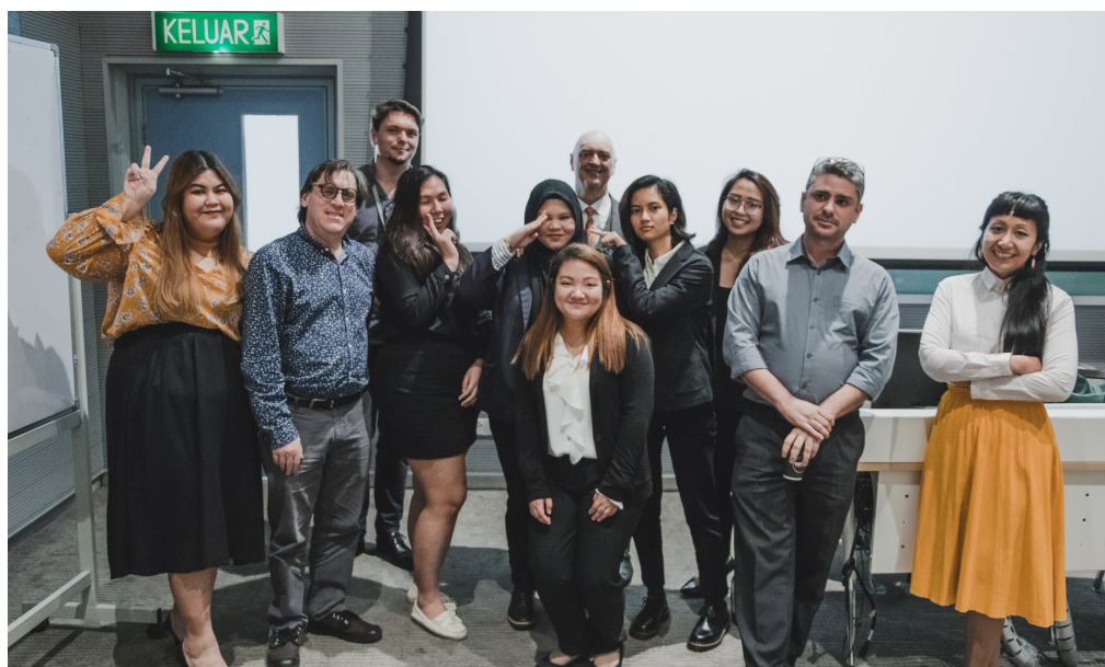
Incoming team of SOAR 2018-2019 with School of Arts staff members.