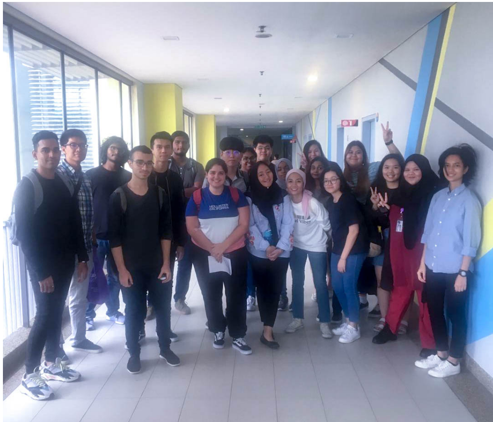
SOAR committee members with students from the January 2019 intake.