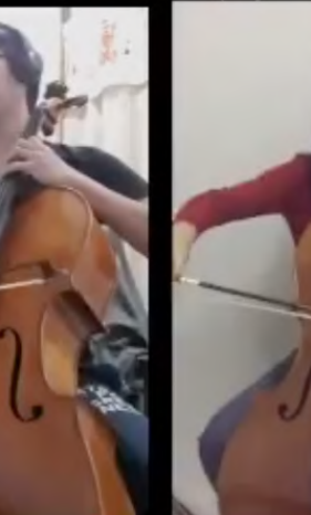
finché vita in petto avro as long as my heart beats