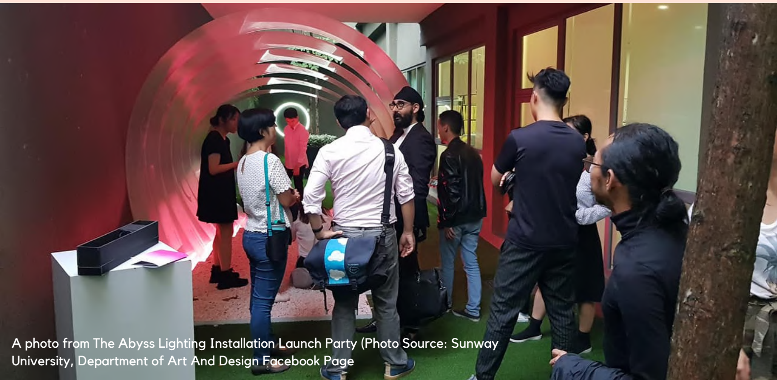
A photo from The Abyss Lighting Installation Launch Party