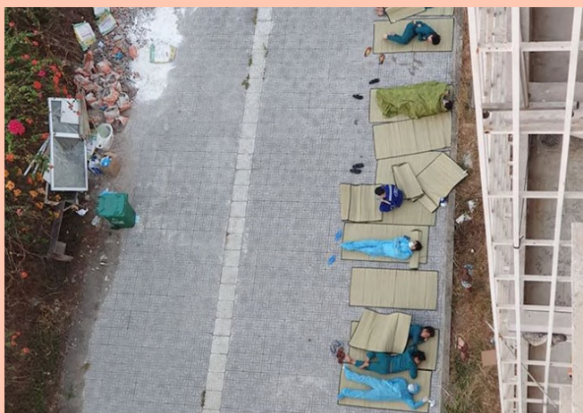
The staff were sleeping outside the quarantine area after exhausting work shift