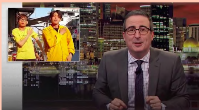
"Ghen Co Vy" song was praised internationally and was mentioned in an American news program - HBO as a catchy song and cute choreography to cheer people up in the pandemic.

Furthermore, photos of staff eating their meals in a hurry and taking a short nap before venturing in the frightful combat doubtlessly ignited compassion in many. Some quarantined people even "blamed" the staff for feeding them so well (3 adequately nutritious meals per day) which made them gain several kilograms after only a couple of weeks. I can say that this catastrophe has truly reinforced my belief in the humanitarian efforts in our modern and busy society.