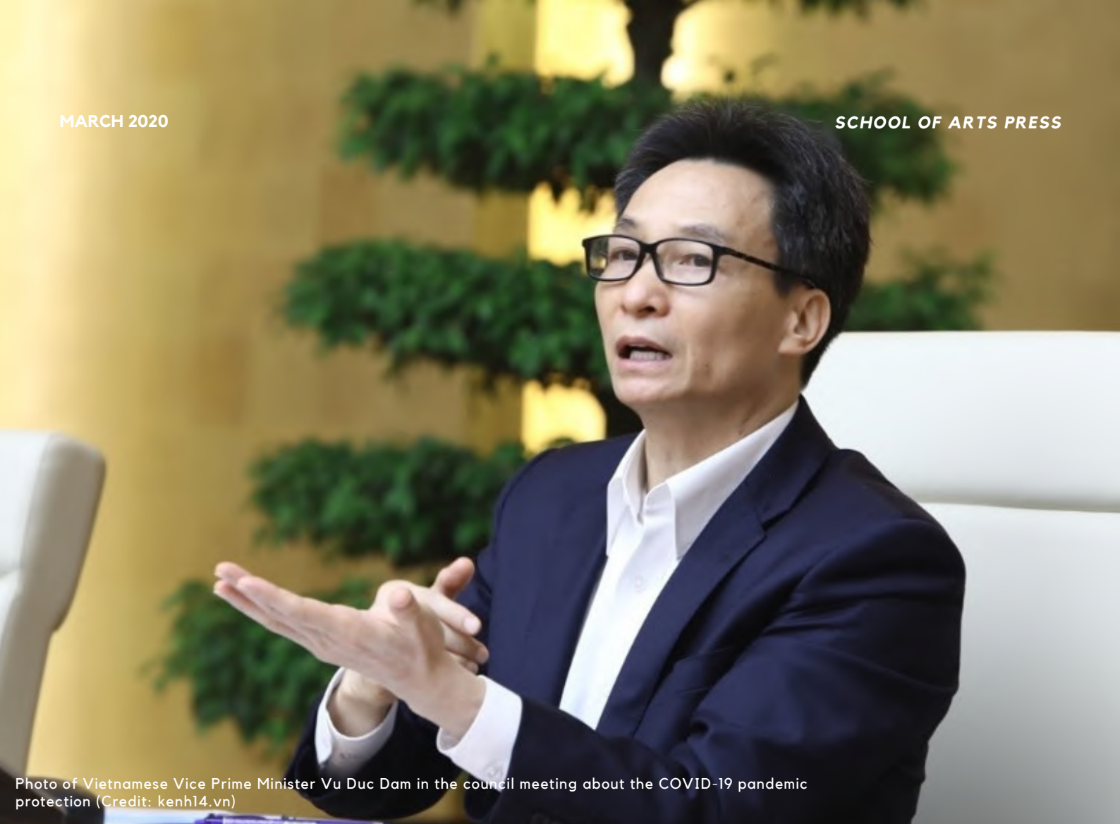
Photo of Vietnamese Vice Prime Minister Vu Duc Dam in the council meeting about the COVID-19 pandemic protection

More than that, all schools across the nation have delayed the start of the new semester since February this year. A lot of Vietnamese who are living, studying, and working abroad have returned to their motherland from around the world with the assurance that they will be given utmost care for their health and safety by the authorities. All services except supermarkets, convenience stores, hospitals, and gas stations are shut down for the sake of curbing the spread of the COVID-19. The authority also enforced the border closure to prevent people from entering our country. All mass gatherings are prohibited as well.