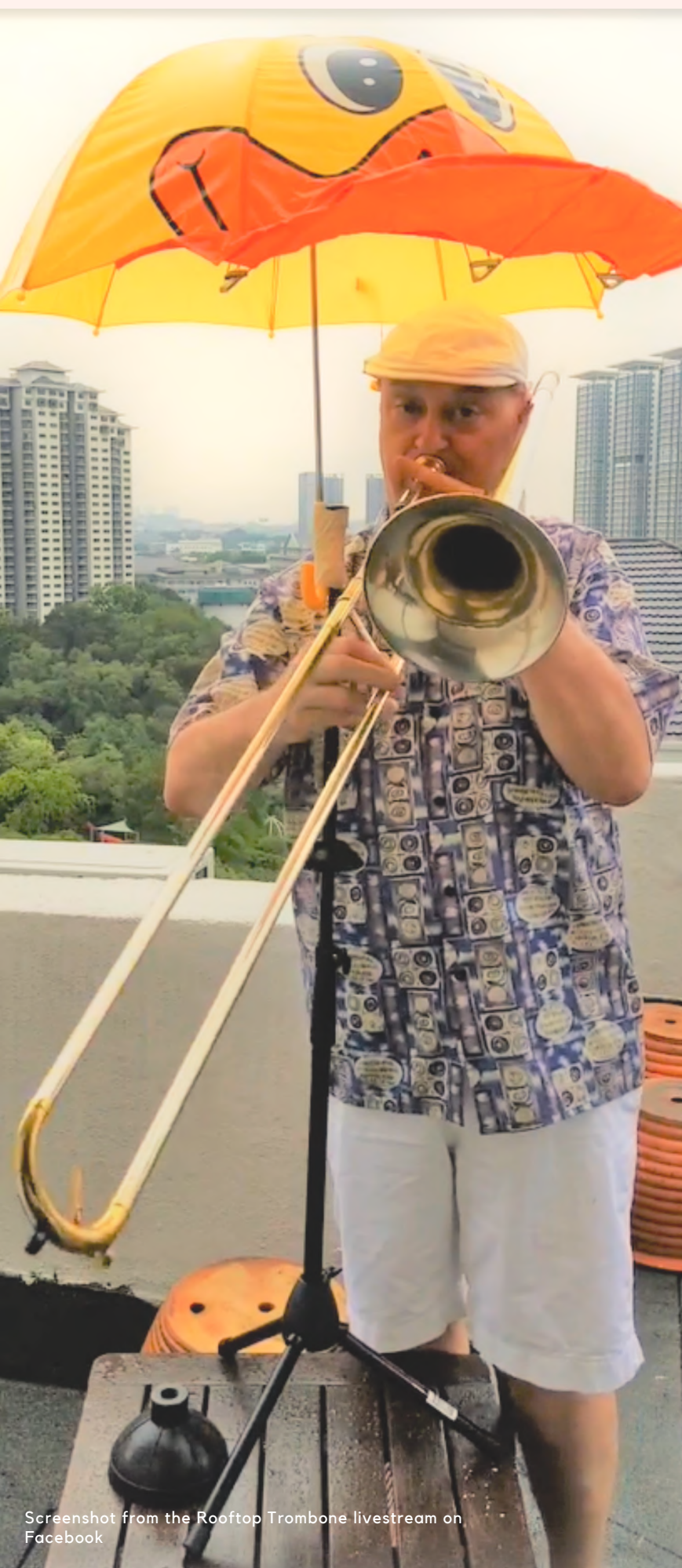
Screenshot from the Rooftop Trombone livestream on Facebook

Oh, I got the Isolatin' Blues I feel I've got nothing to lose I need a great big bottle of booze — or I'll SHOUT!