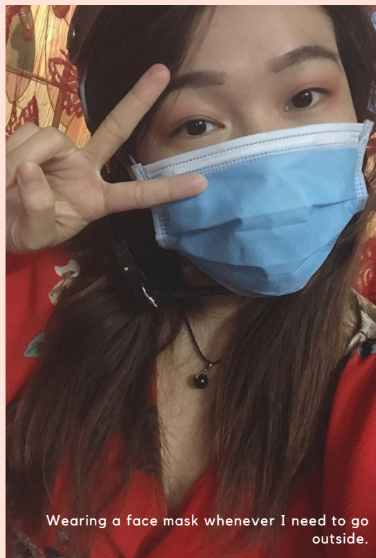
Wearing a face mask whenever I need to go outside.

VIETNAMESE VICE PRIME MINISTER, VU DUC DAM.