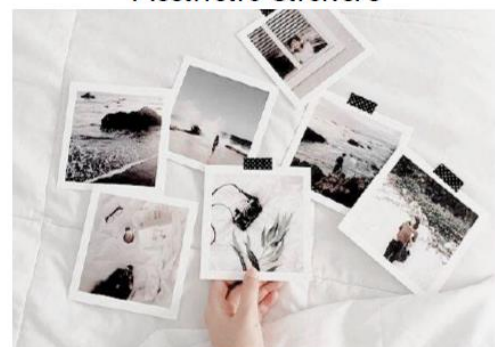
Polaroid Photography Available from 12 - 4pm