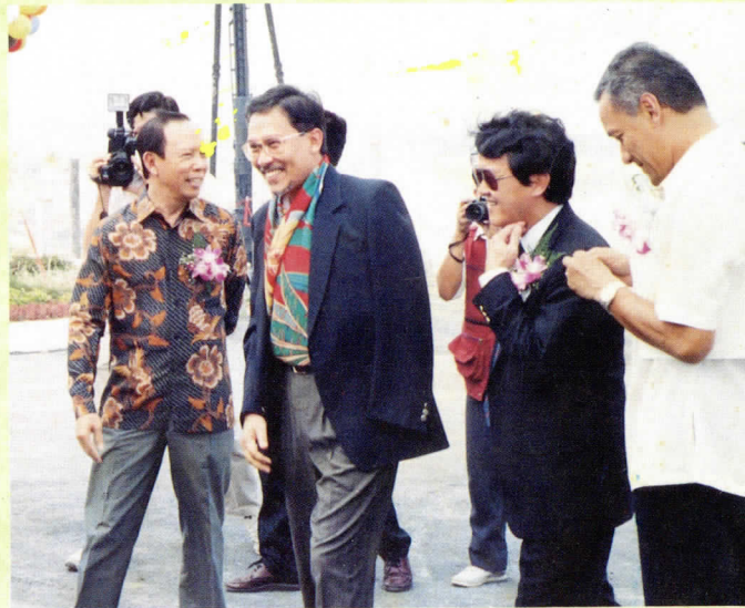
The arrival of YB Dato' Seri Anwar Ibrahim