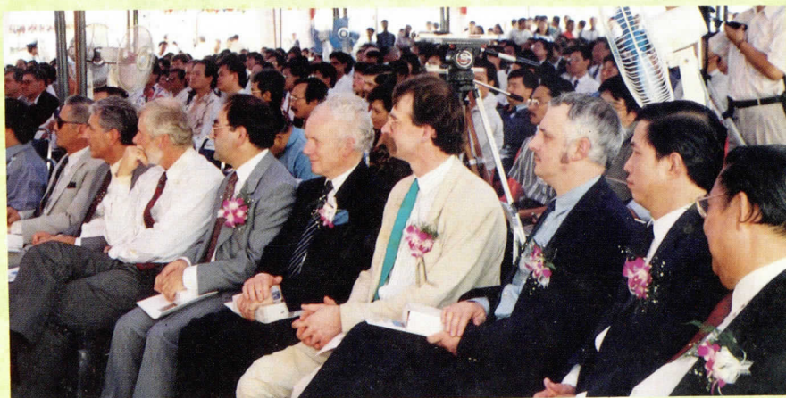
Invited guests at the Sunway College ground breaking ceremony