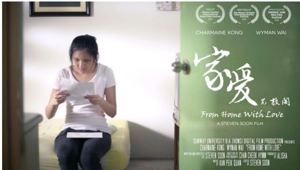
Promotional poster for "家爱 - From Home With Love".