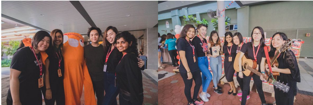
Student committee and helpers behind the "beYOUtiful" campaign.

Congratulations to the student organisers of the ‘beYOUtiful’ campaign, as it truly is an unforgettable one.