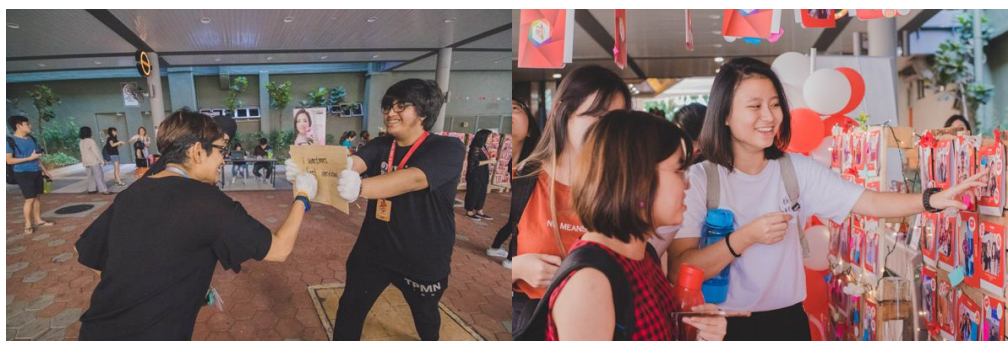
Students and lecturers taking part in the photo exhibition.

The overall duration of the campaign was 6 weeks, from 20 April 2018 to 1 June 2018. Throughout the 6 weeks of the campaign, students organised various different events, including the opening ceremony, "it's a beYOUtiful day", a photo exhibition and a closing ceremony. The campaign was mainly promoted through social media platforms such as Facebook and Instagram as well as word of mouth amongst students and lecturers.