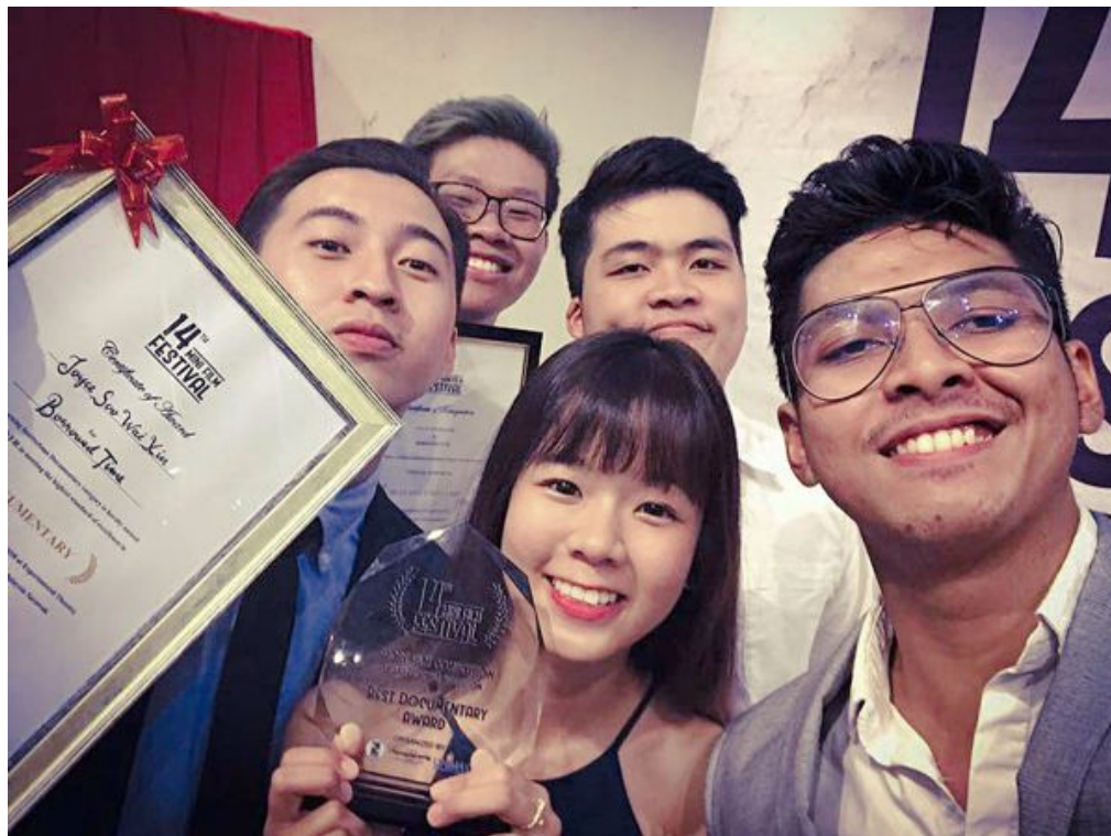
Students pose for a picture after winning several awards from the UNIMAS Mini Film Fest 2018.

Sunway University School of Arts is very proud of our students, and their achievements. Keep it up Digital Film Production students!