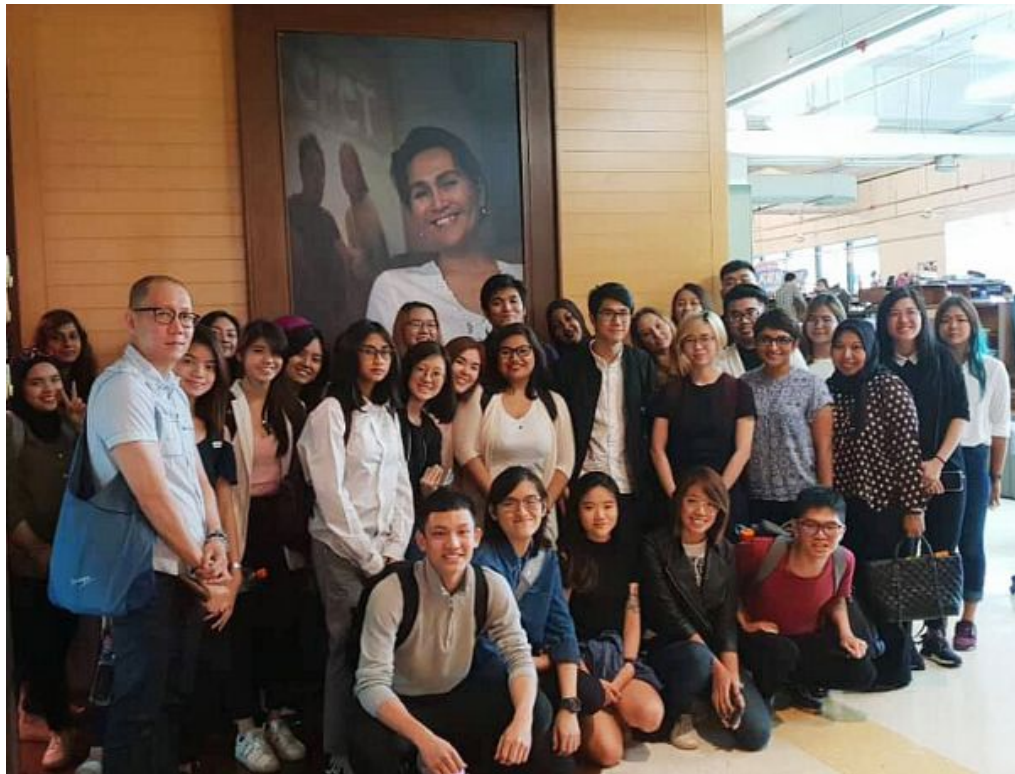
Advertising Design students and lecturers pose for a photo in Leo Burnett.