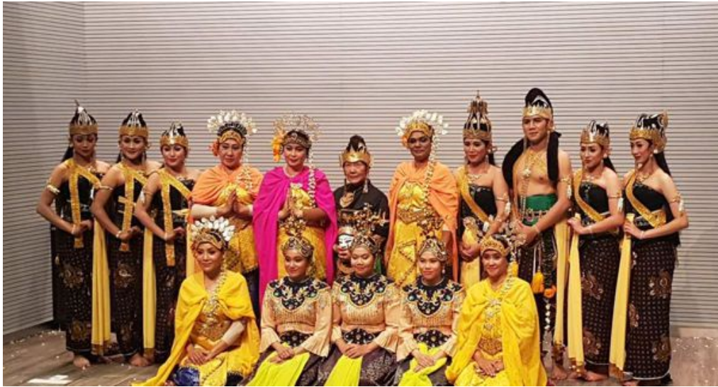
Performers gather on the stage to pose for a group photo.