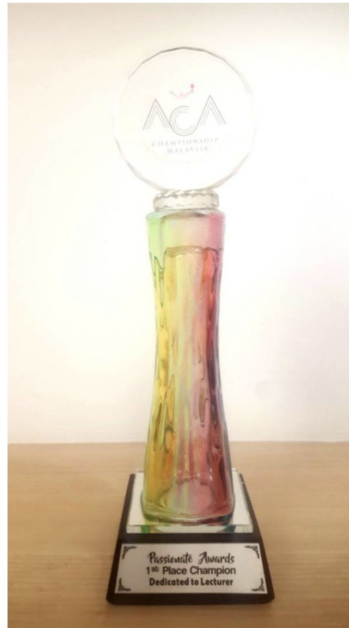
Trophy for Passionate Lecturers Awards.