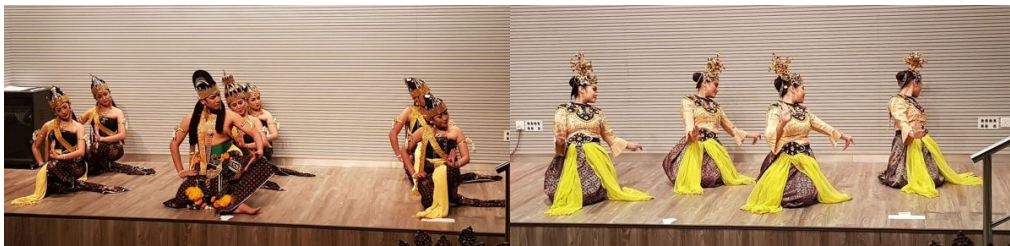
Performances from Southeast Asian Royal Courts on the first day of the symposium.