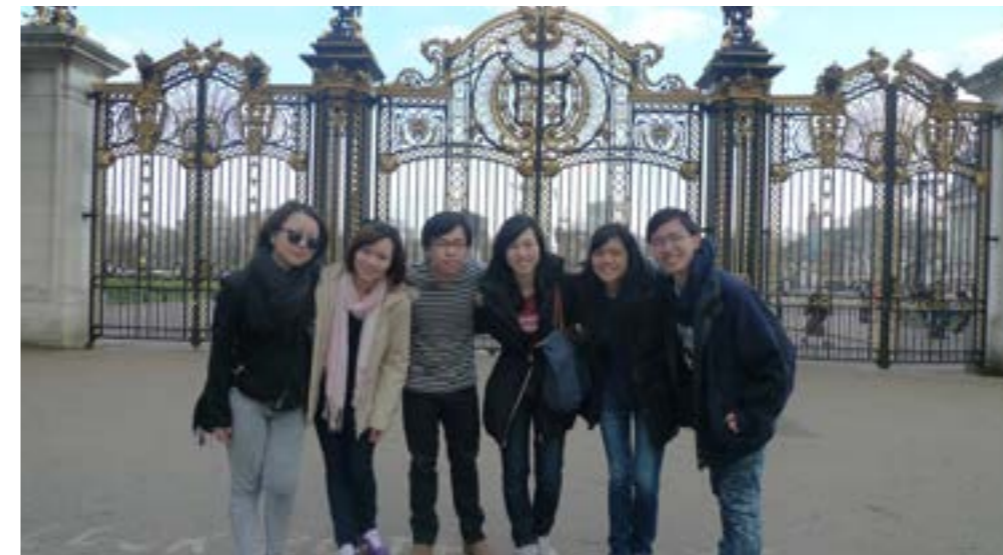
Students posing in front of Buckingham Palace, London