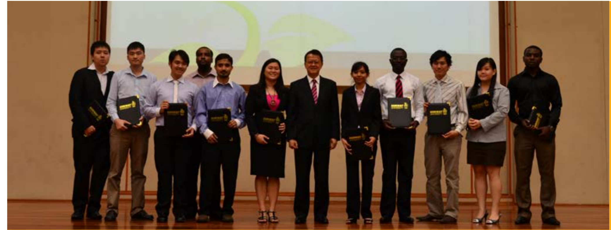
Tan Sri Dato' Seri (Dr) Jeffrey Cheah, AO, with some of the scholarship recipients

Sixteen Diplomates and Graduates were presented with the Tan Sri Jeffrey Cheah Scholastic Award.