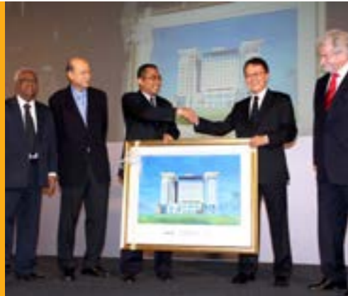
YB Dato' Seri Mohamed Khaled Nordin (3rd from Left) receiving a memento from Tan Sri Dato' Seri (Dr) Jeffrey Cheah Fook Ling, AO

At the start of 2012, The Minister of Higher Education YB Dato' Seri Mohamed Khaled Nordin officiated the ground-breaking ceremony of Sunway University's new 12-storey building on 20 January. The University also won the Reader's Digest Trusted Brands Gold Award in 2012.