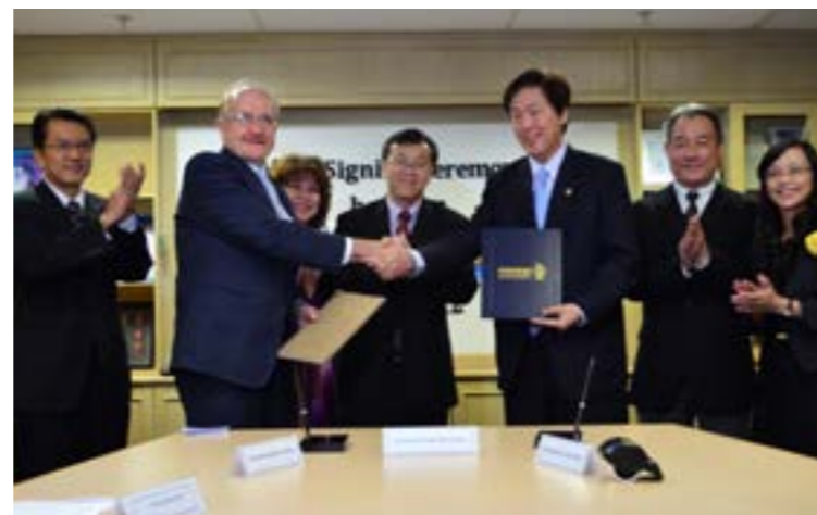
Memorandum of Understanding between Sunway University and Feng Chia University, Taiwan