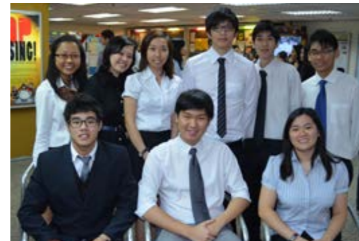
2012 Student Council