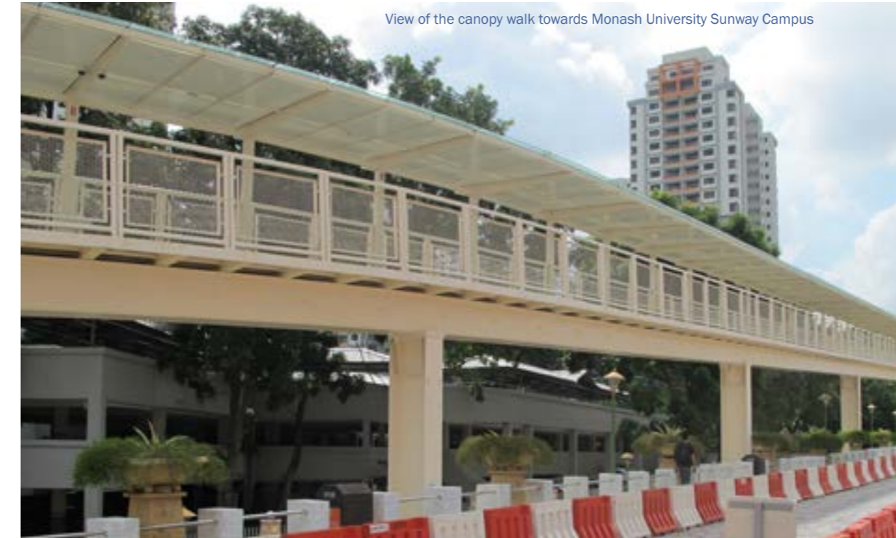
View of the canopy walk towards Monash University Sunway Campus

THOL was successful in maintaining its ISO9001:2008 certification after a SIRIM Recertification Audit on 12 - 13 April.