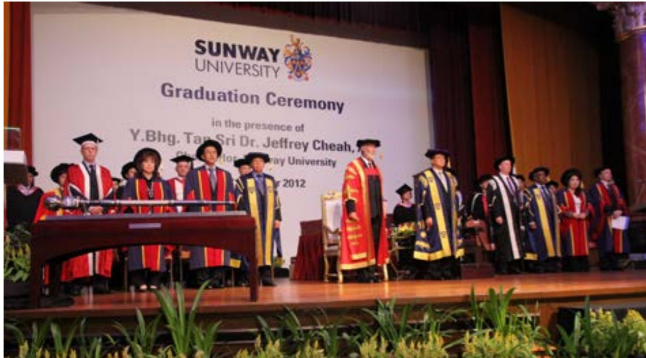
Graduation Ceremony held in the Grand Lagoon Ballroom, Sunway Resort Hotel & Spa