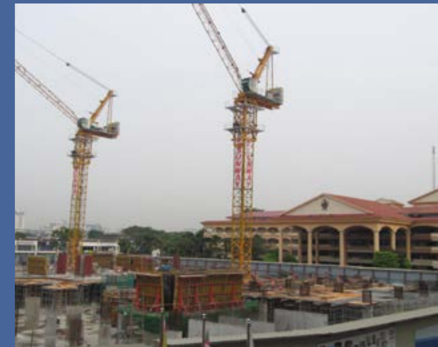
Construction of the University's new campus building

Connectivity around the Sunway campus was significantly improved for pedestrians in 2012 with the opening of the extended canopy walk to Monash University Sunway Campus. This enables students and staff to walk safely between the two universities and the Sunway Pyramid shopping mall, without interacting with road traffic, besides encouraging more walking and reduction in vehicle use for moving around the Sunway integrated city.