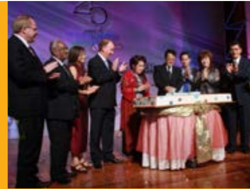
Silver Jubilee Dinner

Perhaps the crowning glory for Sunway University in 2012 was the achievement of grade 5 (Excellent) in the national academic quality assessment exercise SETARA'11, conducted by the Malaysian Qualifications Agency (MQA). This follows the award of the same grade in the previous exercise SETARA'09, confirming the continuing high standard of academic procedures and processes. This sets Sunway University among the highest teaching quality institutions in the country.