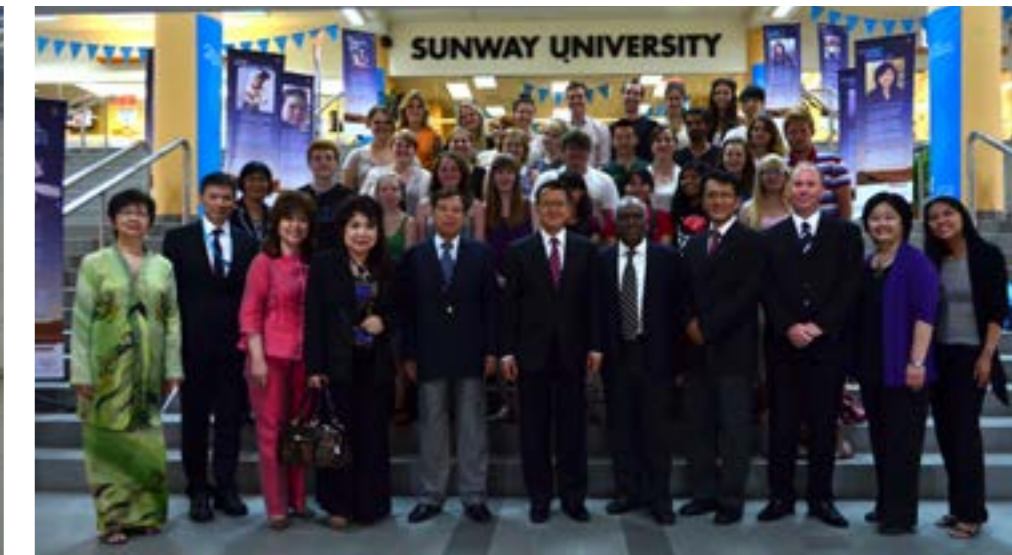
Lancaster University Summer Programme Students with University officials